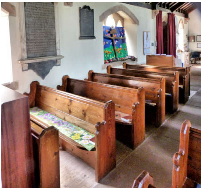
seen from the Lectern

3: The photographs below show the present arrangement of the South Aisle:-