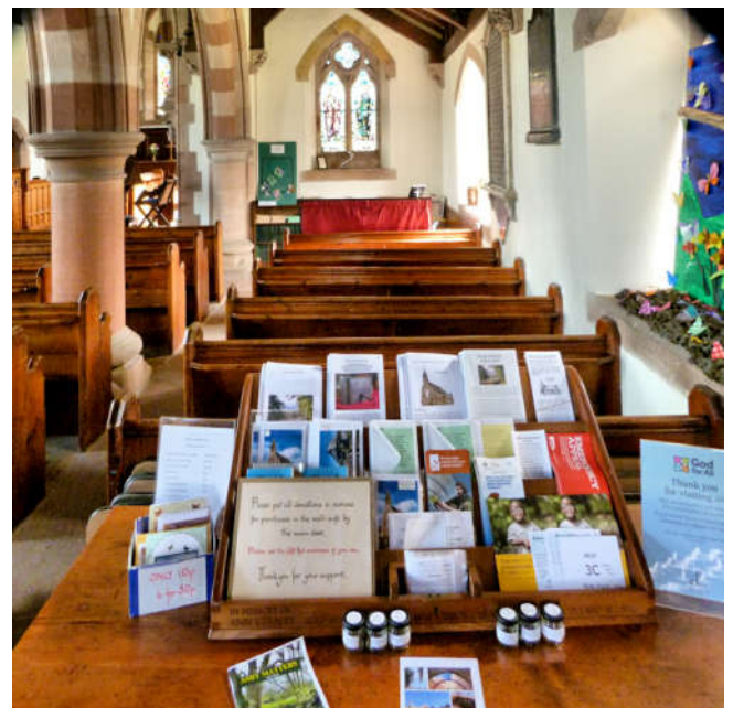
and from the West end

and the plans below & overleaf show the aisle as at present, and as envisaged:-